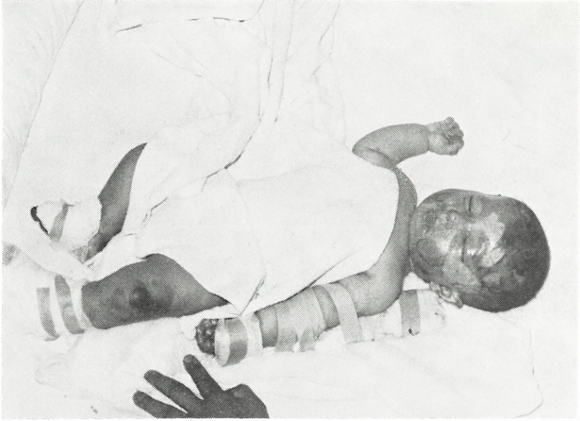
An Arab child, victim of Israeli napalm bombs.