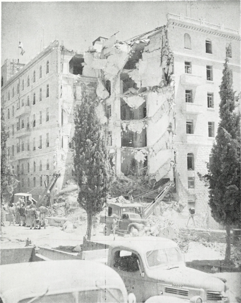
The Wing of the King David Hotel housing the Government Secretariat blown up by Zionist Terrorists with the knowledge of the Jewish Agency, 22 July 1946.