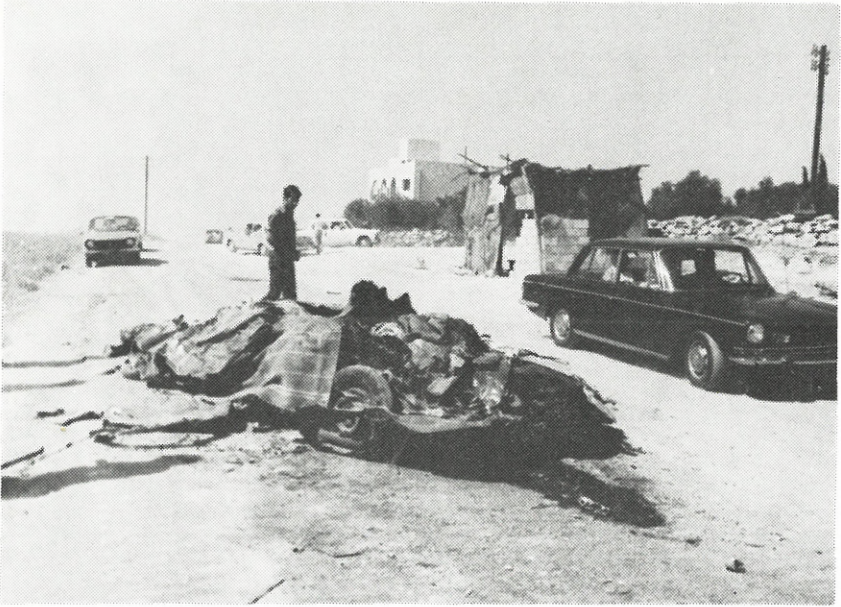
Remains of private car and a family of seven run over and crushed by an Israeli tank on 18 September 1972.