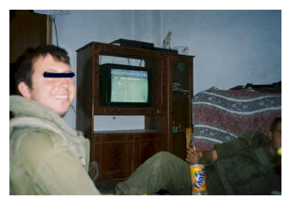
Figure 10 Soldiers watching football in a Palestinian house

We were in the middle of a house-searching operation in the refugee camp, when we entered one of the houses, evacuated the family into one room, according to procedure, and searched the house. By the way – as we entered, the family was watching the soccer world-cup finals and left the TV on. We were tempted and sat to watch the game. Gradually, everybody joined, the whole unit, crowded in front of the TV – including the platoon's vice-commander – and watched the game. Meanwhile the family waited in the room we put them into earlier. (BS maltreatment)