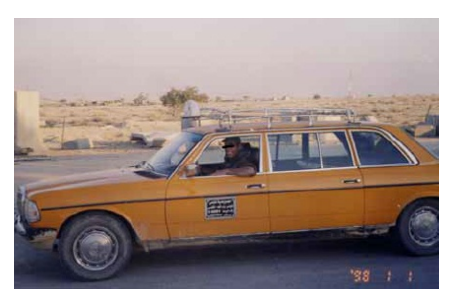
Figure 12 Soldier having himself photographed in a Palestinian taxi