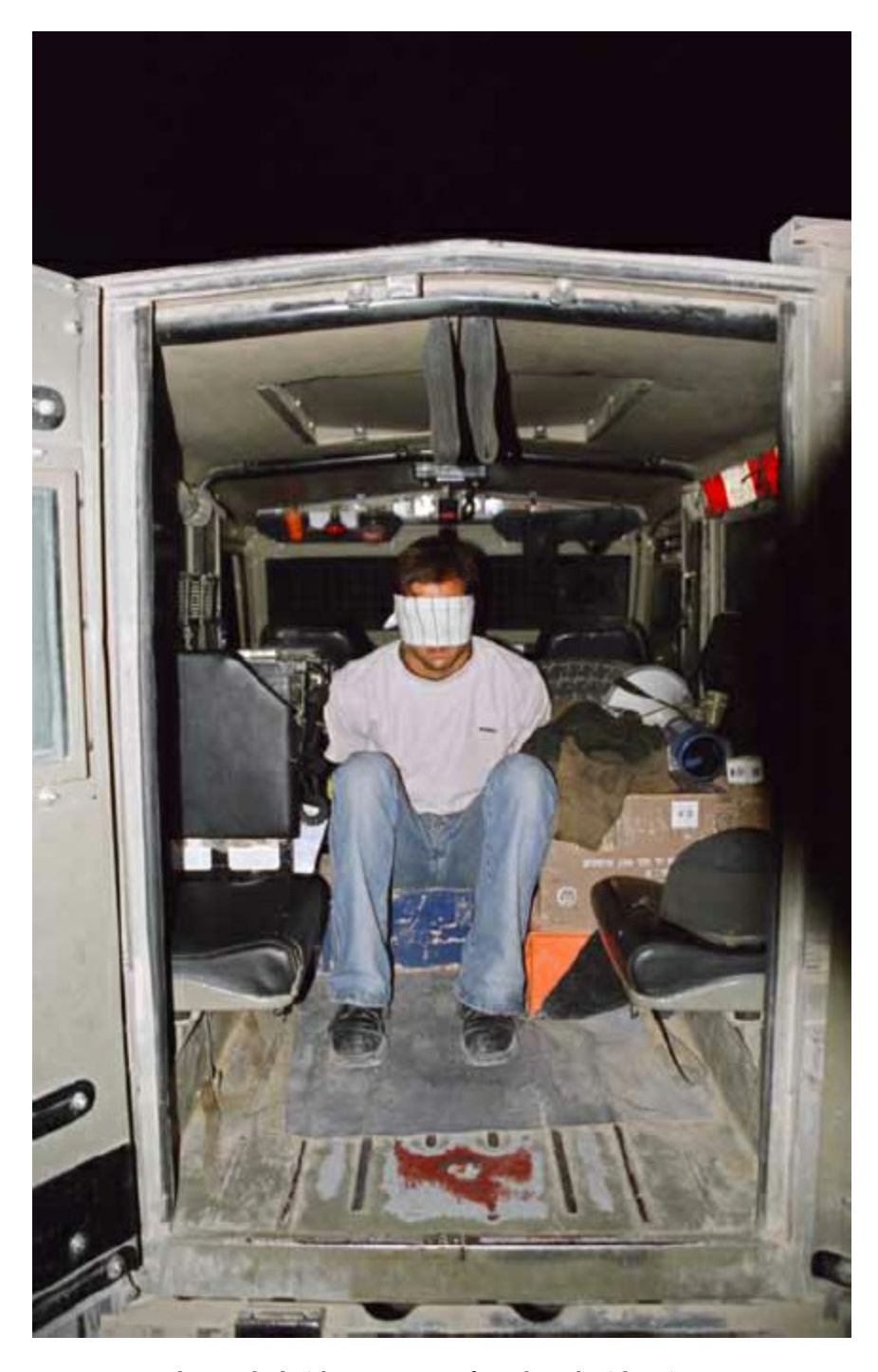
Figure 15 Palestinian arrestee in military vehicle