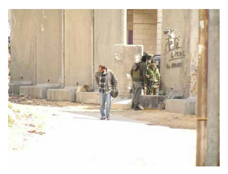
Figure 1 Soldiers at work: checking Palestinians moving between one side of the wall to the other

Before I start to discuss the different spaces soldiers work in, one very central aspect of their work should be highlighted. The work Israeli soldiers perform in the OPT is not so much classical military work as it is policing work. The excerpt of the poem by Ron-Furer, cited above, gives us an insight into the way this makes soldiers feel. The main tasks of soldiers working within the occupation, as we shall see shortly, consist of guarding, carrying out arrests, manning checkpoints and searching people, cars and houses. Importantly, the intense contact with the civilian population is an aspect of the work that makes it profoundly different from the 'classical' military work of combat operations against hostile enemies. Actual combat, as we shall see further on, is only a small part of the activities for most Israeli combat soldiers in the OPT.