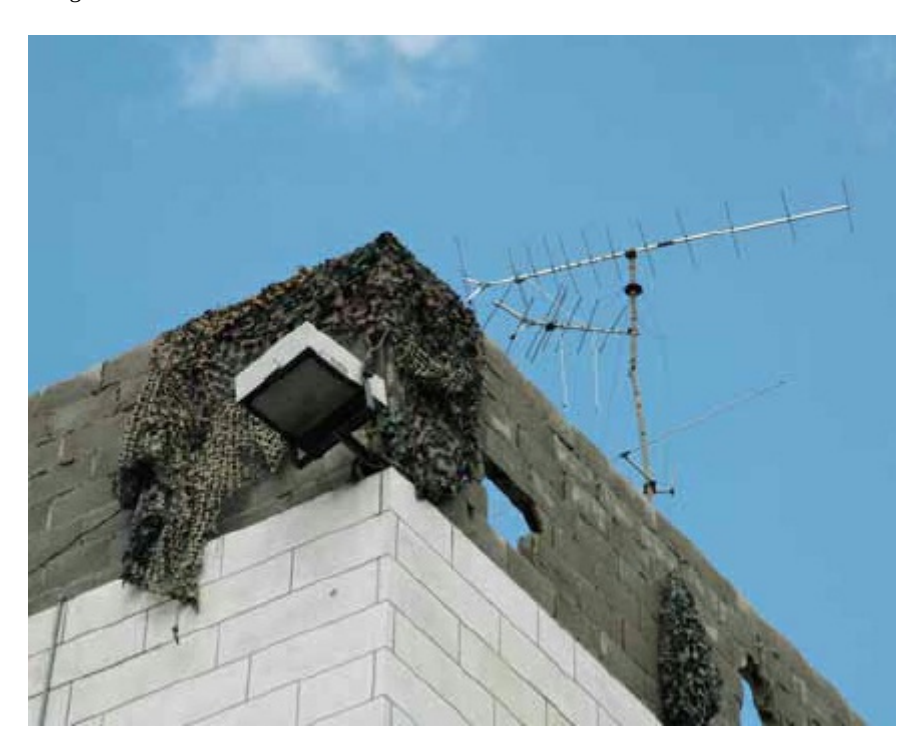
Figure 9 'Straw widow' in Hebron

You have a thing that is called 'straw widow' in the military, that's to be in an Arab house for a few days, that was horrible, I remember it was...(Q: 'What happens exactly?') You get inside the house; you move the whole family to a room of their own. (Q: 'Do they know in advance that you are coming?') No, they don't know in advance. You get into the house, their house has an advantage for us like a good observation point, and the family goes into one room, someone watches the family...but you don't touch their things.