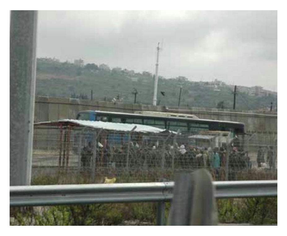
Figure 3 Small checkpoint in the OPT

In order to travel through different areas within the OPT, Palestinians need a permit. These permits are distributed by the DCO (District Coordination Office) of the IDF. Most Palestinians have to pass checkpoints daily to get to work, to school, to visit family members, to go shopping or to see a doctor. Rules on who is allowed to pass the checkpoint, and who is not, change from day to day and depend on orders from either the higher echelons of the military or from lower commanders in the field. The arbitrariness of commands and the implementation of rules is typical for the situation in the OPT since the outbreak of the Al-Aqsa Intifada, as Ben-Ari, Lerer, Ben-Shalom and Vainer have observed in their detailed study of this conflict (Ben-Ari et al. 2010: 41–42).