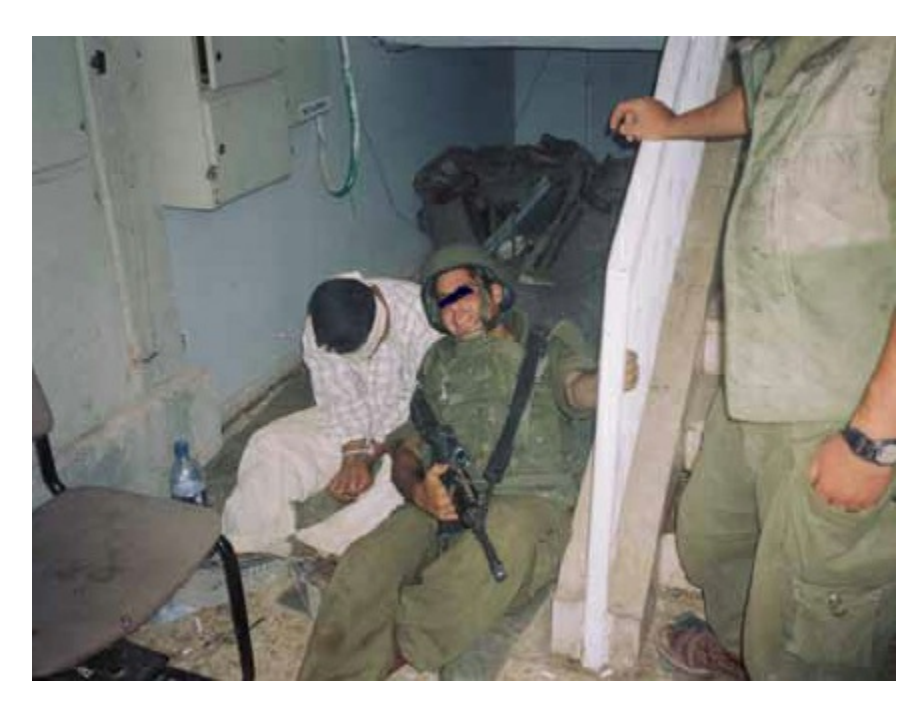
Figure 7 Soldiers with an arrestee in a Palestinian building