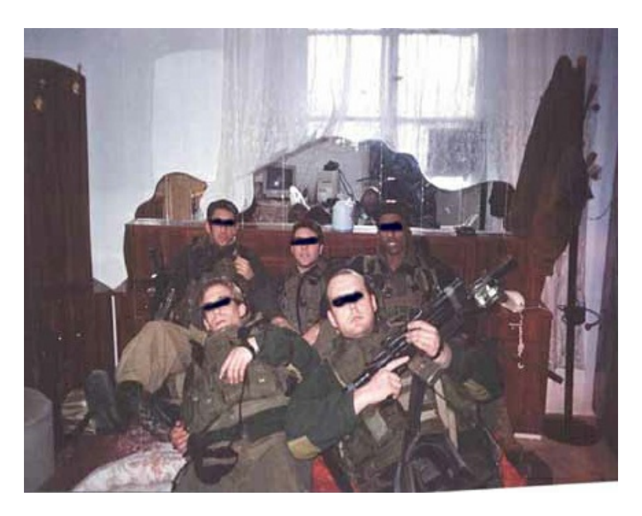
Figure 11 Military unit inside Palestinian house

If we can imagine the atmosphere in a Palestinian house during an arrest or a search we can probably sense the fear and frustration of the residents. This description of a military operation by a Palestinian writer is telling: