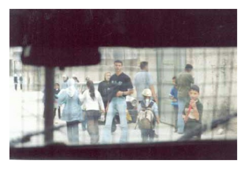
Figure 14 View from within a military vehicle, Hebron

soldiers, a subject that has been discussed above. This distance can have the same effect as that discussed before in guarding the soldier against getting too involved. From a jeep it is easier to see a 'category' ('a young man' or 'an old farmer') than to see actual individual persons that you can relate to.