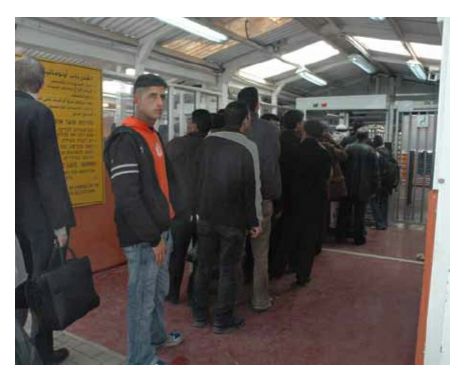
Figure 5 Qalandia checkpoint, new style

The (in)famous wall or, as the official Israeli state discourse has it, the security barrier, has been built right next to the checkpoint, making the checkpoint the main entry point to Jerusalem from Ramallah. The parking spaces beside the new terminal are unused as no one can reach the checkpoint by car. Taxis take their passengers to a point some 200 metres from the entrance, from where one has to walk to the terminal. After passing, one can find taxis on the other side, again after walking about 200 metres. To enter and exit the checkpoint, one has to pass through metal turnstiles, which makes it very hard to carry large objects such as suitcases and children's strollers as these do not fit through. For this reason children are carried in their mother's arms through most checkpoints in the OPT.