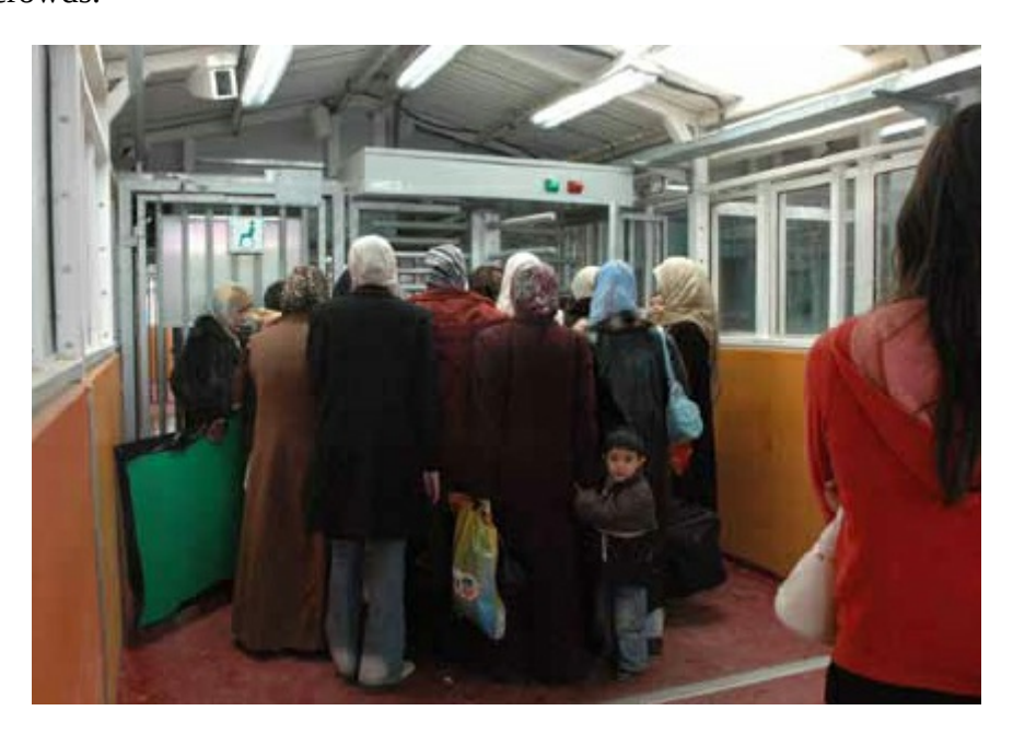
Figure 6 Qalandia checkpoint

During another visit in February, the rain turned the whole area around the checkpoint into a muddy pool. It was cold in the terminal, people were shouting, children were crying, there was pushing and shoving and faces were angry with frustration. The waiting area smelled of damp clothes and crowds.