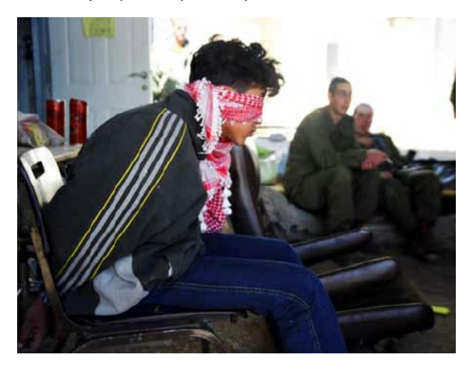
Figure 13 Arrested boy detained

and put them in the sun, so they'll learn. No wonder there are people that do that...Why? Because you haven't been home for 2 weeks, you do 8–8 at the checkpoint, you are hot, you are thirsty; it's the easiest.