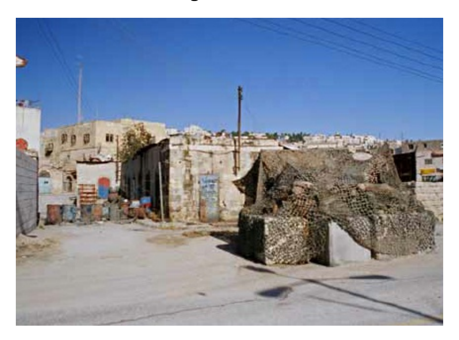
Figure 2 A military post in Hebron

Human bodies are controlled by predetermined routes overloaded with railing, barbed wire, electronic fencing, boulders, stone and canvas walls, escalators and one way passages.