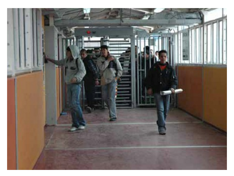
Figure 4 Qalandia checkpoint, new style

At the old checkpoint, soldiers would stand outside under a tin roof behind piles of sandbags that served as a security measure. In this setup, the soldiers were in direct contact with the passing Palestinians, checking their bodies, bags, IDs and other possessions manually. At the new checkpoint, soldiers sit behind bulletproof glass, speak only through an intercom and manage the stream of passing Palestinians from a distance. When IDs or permits have to be shown, they are put in a metal drawer that is pulled inwards by the soldiers for inspection. The Palestinian 'passengers' put their bags through the X-ray machines and walk through a metal detector just like at any border crossing at an air, land or sea 'port' between two countries. As mentioned before, this comparison is no coincidence as such checkpoints are erected as permanent border crossings, creating 'facts on the ground'.