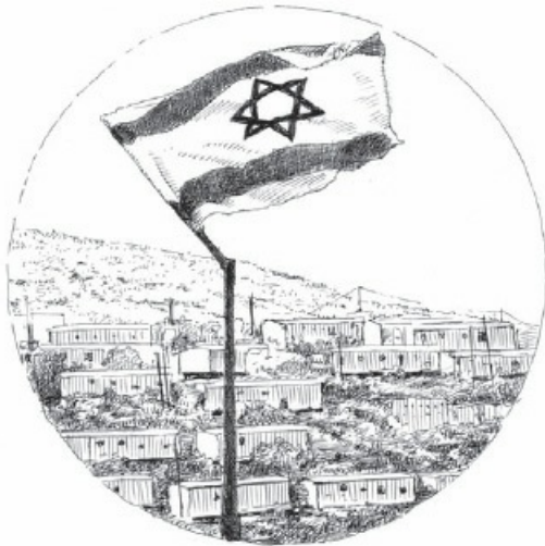
ELI SETTLEMENT, WEST BANK