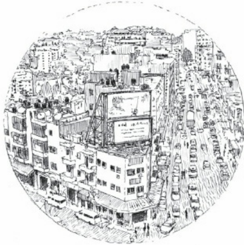
INTERSECTION IN RAMALLAH, WEST BANK