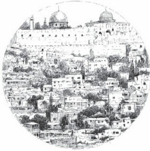
SILWAN, EAST JERUSALEM