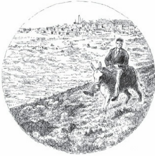
WEST BANK FARMER WITH ISRAELI SETTLEMENT IN BACKGROUND