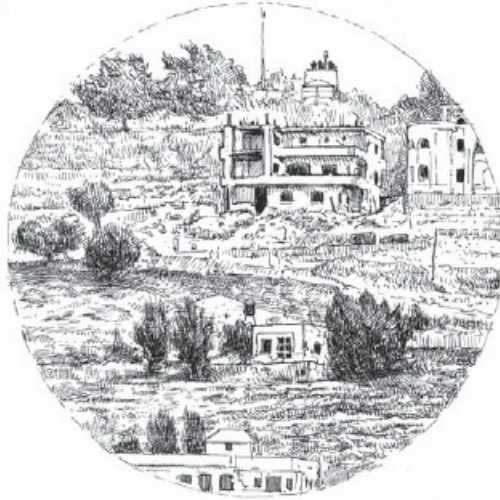
KAFR MALEK, WEST BANK