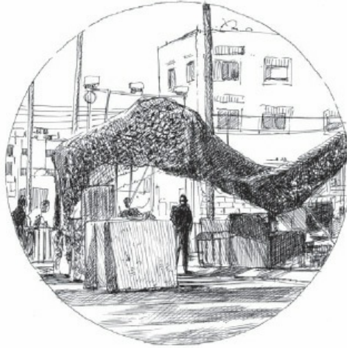
ISRAELI MILITARY ROADBLOCK, WEST BANK