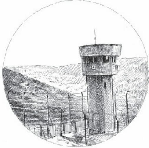
GUARD TOWER AT DAMUN PRISON, ISRAEL