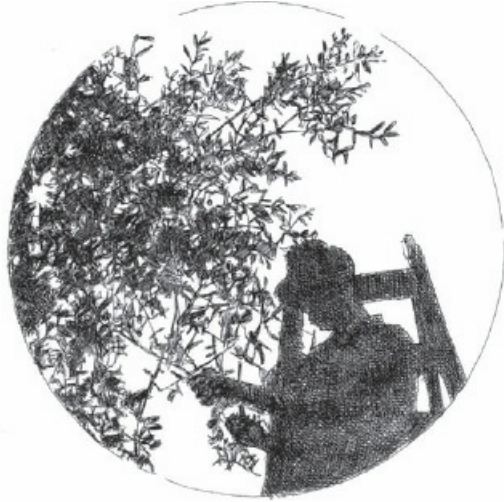
MAN PRUNING OLIVE TREE