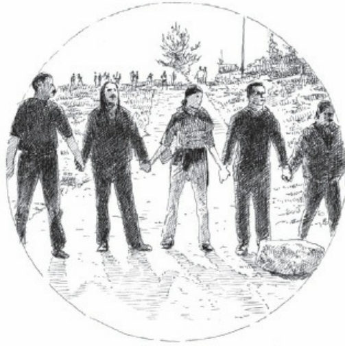
PROTESTERS NEAR BIL'IN, WEST BANK