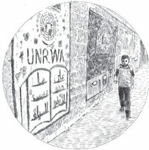
UNRWA MURAL IN RAMALLAH, WEST BANK