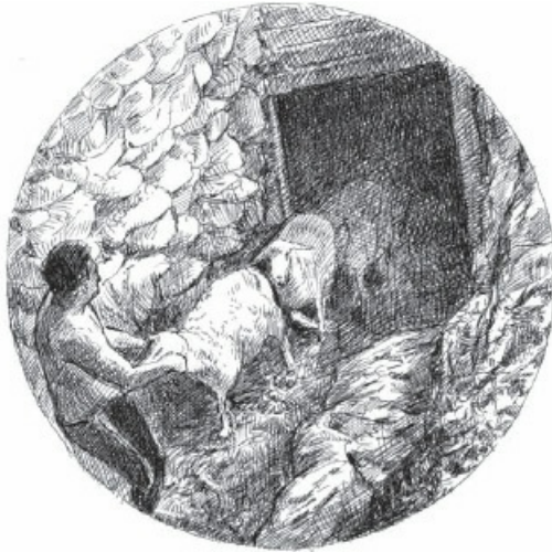
MAN BRINGING LIVESTOCK THROUGH TUNNELS INTO GAZA