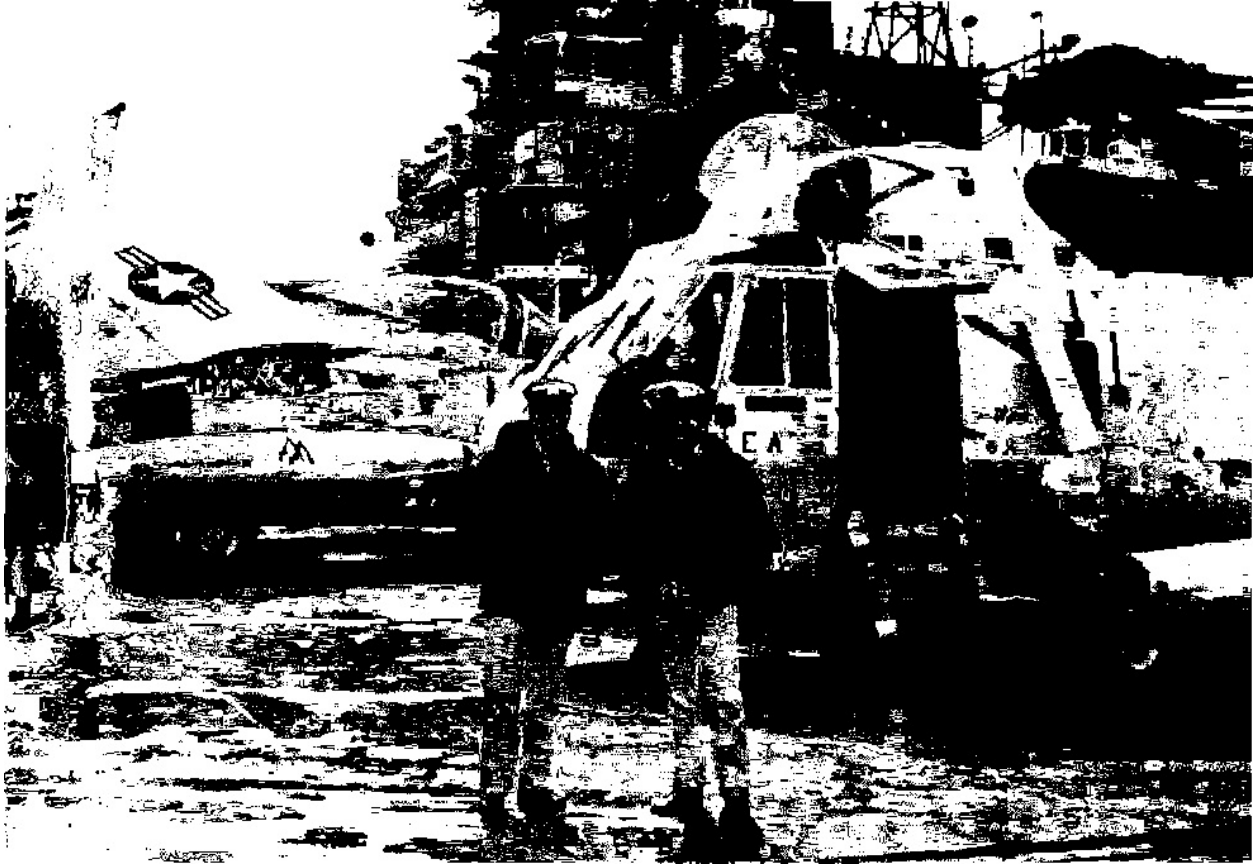
Standing on an American aircraft carrier docked in the port of Haifa, 198 L Because I could speak English fluently, I often served as a liaison to American ships.