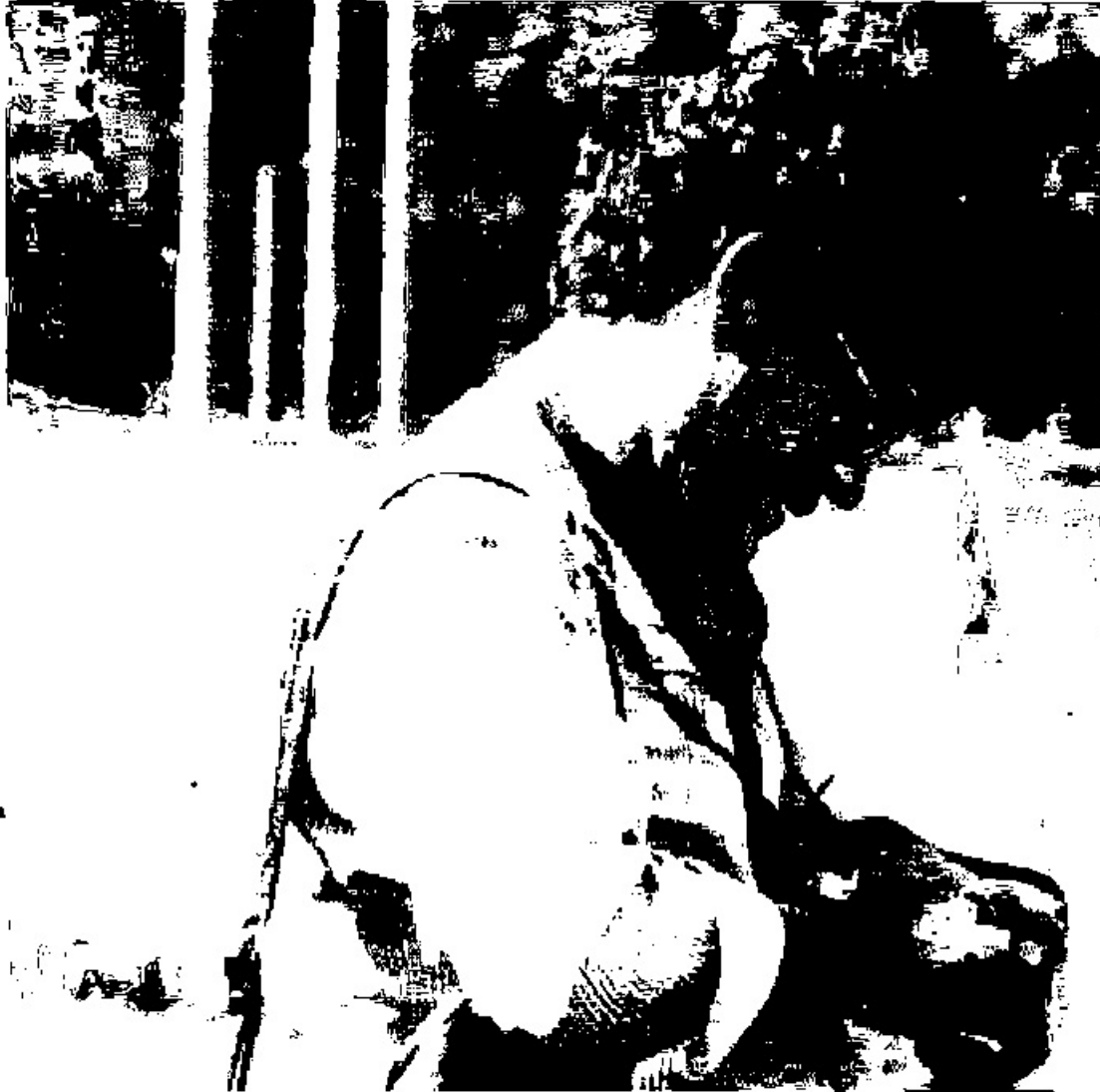
Stopping to load a camera while in the midst of a Mossad photography exercise.