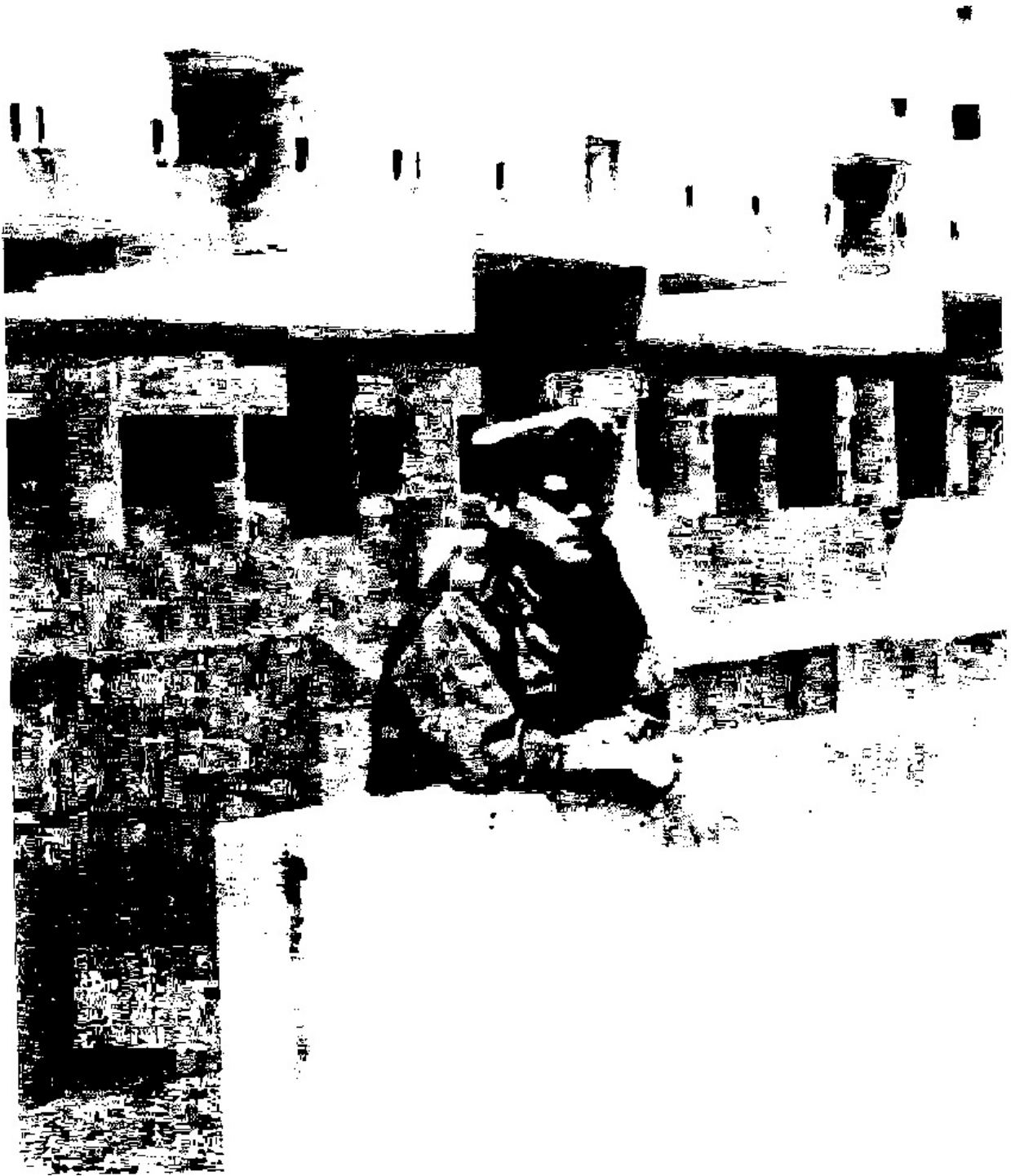
Outside the officers' school in Mitspeh Ramon, 1968. I'd just turned eighteen and looked forward to a long military career,