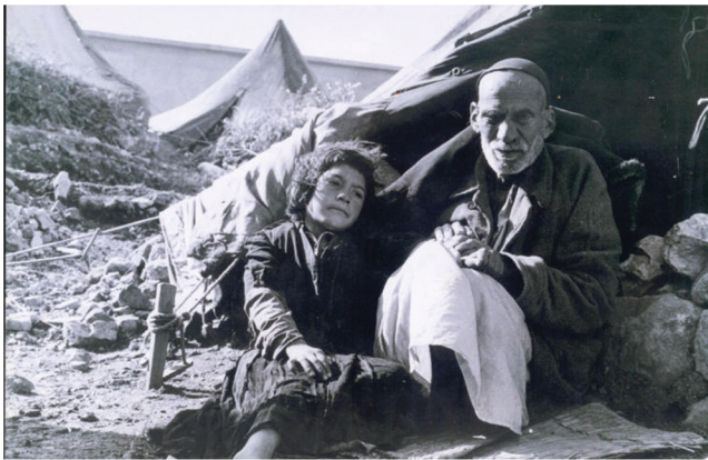
1948: Palestinians made refugees

The events which culminated in the Nakba and the birth of Israel in 1948 were decades in the making.